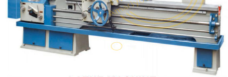
LATHE MACHINE CENTRE 14" / 16" / 18" 355MM / 406MM / 457MM