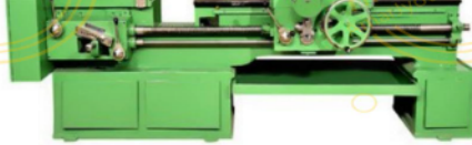
LATHE MACHINE CENTRE 12" 305MM