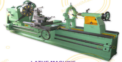
LATHE MACHINE HEAVY PLANNER TYPE CENTRE 28" / 30" / 32" / 34" / 38" / 46" / 711MM / 762MM / 813MM / 864MM / 965MM / 1016MM