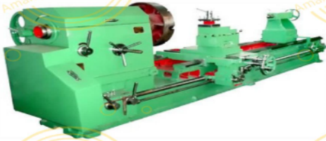
LATHE MACHINE ROLL TURNING PLANNER CENTRE 16" / 18" / 20" / 22" / 24" / 26" / 30" / 34" 406MM / 457MM / 508MM / 559MM / 610MM / 660MM / 762MM / 864MM