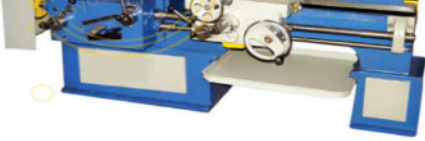
LATHE MACHINE CENTRE 10" 254MM